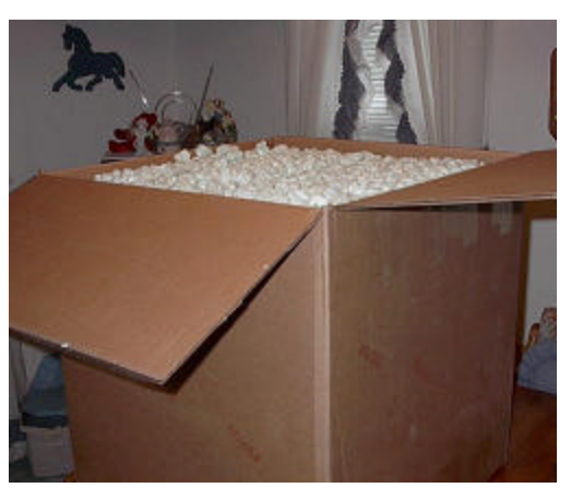
Figure 14 Fill shipping carton with packaging peanuts

2. Utilize packaging peanuts across the bottom of the box, set the bubble-wrapped headlight assemblies in the shipping box, and fill the box with packaging peanuts until you are assured that the contents will not be damaged in transit.