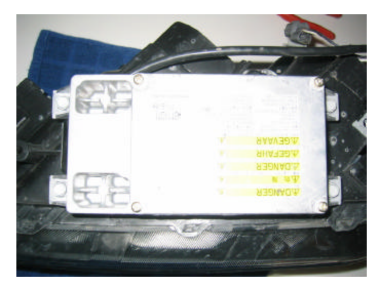
Figure 11 HID Ballast

11. Remove the four screws (10mm) holding the HID ballast to the base of the headlight housing. Once the screws have been removed, slow pull the ballast away from the housing. The HID socket will have to be rotated slightly to fit through the housing to be removed; otherwise it will get caught on the HID Projector.