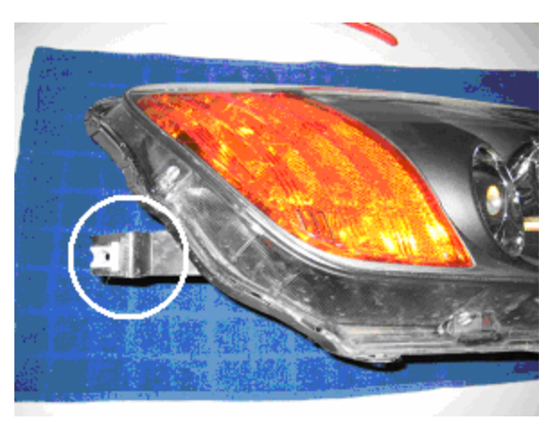
Figure 12 Pack this carefully

When packing the headlights be sure that the box or boxes is of a proper size. Packing them in a box that is too small will cause the headlight to be damaged in shipping. Rick's in not responsible for the damage caused by improper packing . So please take care when packing.