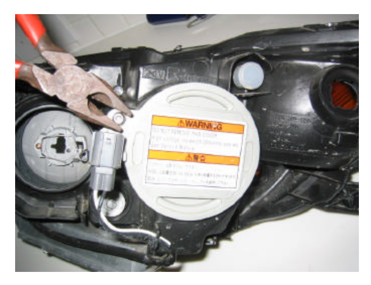
Figure 4 Security Screw Removal T25

4. Remove the "Security Torx 25" screw holding the "Danger High voltage" cover in place. If you don't have a "Security Torx 25" screw driver, just use a set of pliers to remove it.