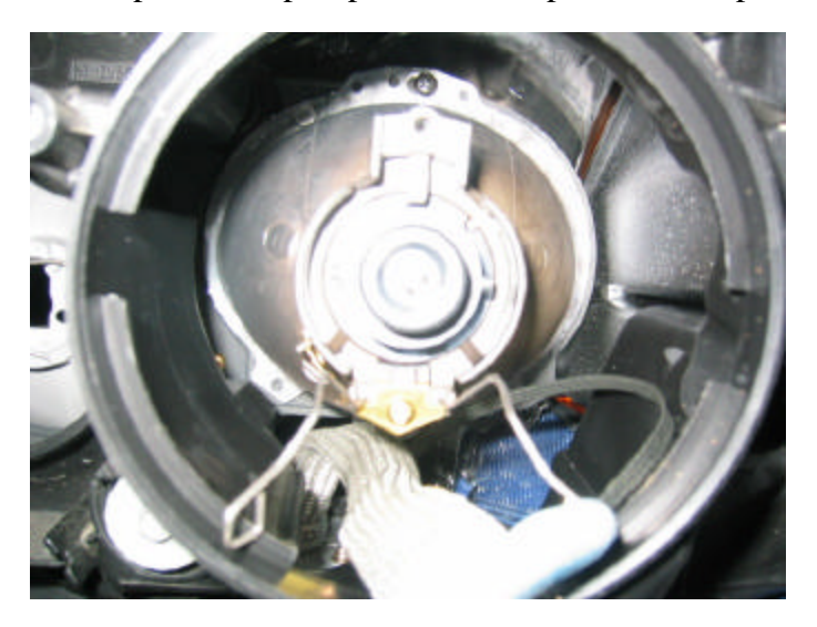
Figure 10 Clip Released

10. Similar to the procedures for removing the High Beam bulb, remove the HID bulb by pulling it straight out. Taking care not to touch the bulb with your hands. Set bulb aside. Re-clip metal clip in place in anticipation for shipment.