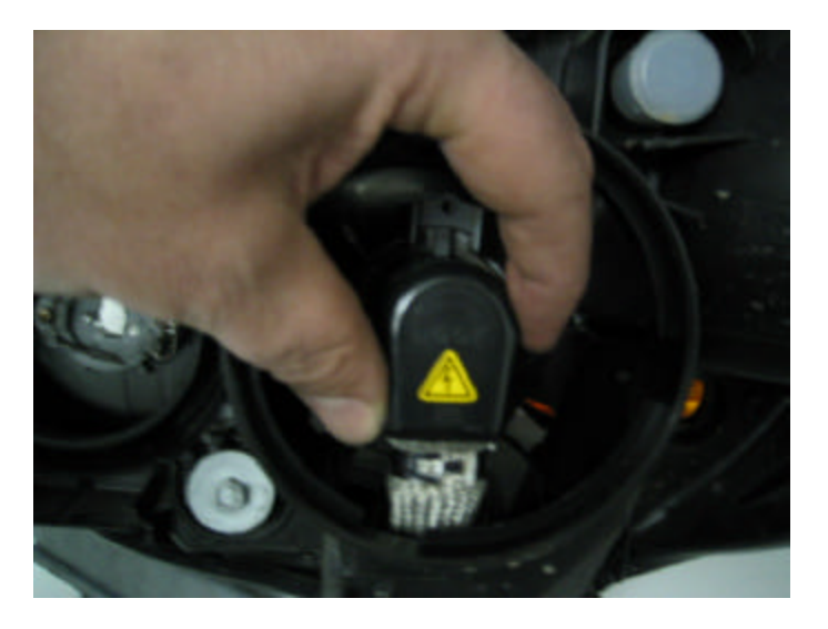
Figure 6a HID Socket (Locked)

6. HID Remove the connector for the HID bulb, by twisting counter clockwise 1/4 then pull. You will feel it release from the bulb.