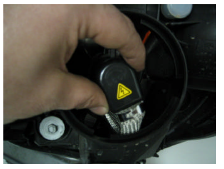
Figure 6b HID Socket (Unlocked)