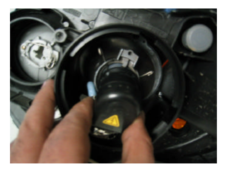
Figure 7 Pull to Remove

7. Pull towards you to reveal the HID bulb.