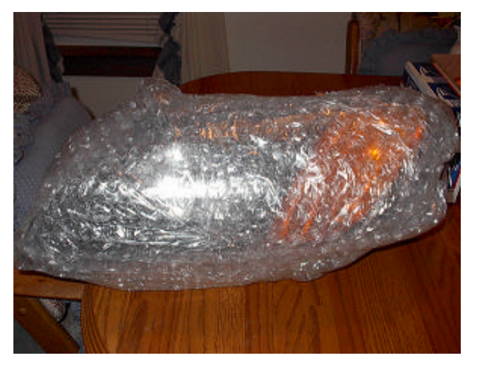
Figure 13 Bubble Wrap each assembly

1. Bubble-wrap each headlamp assembly individually.