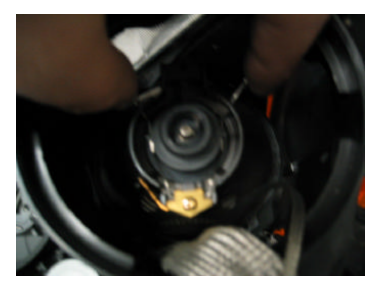
Figure 9 HID Bulb

9. The bulb is held in place by a metal clip. Squeeze the clip together and pull towards you.